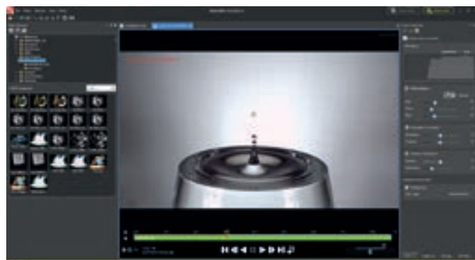
Comprehensive editing- and export function of the recorded sequence with Imaging Studio v4 MovieSuite